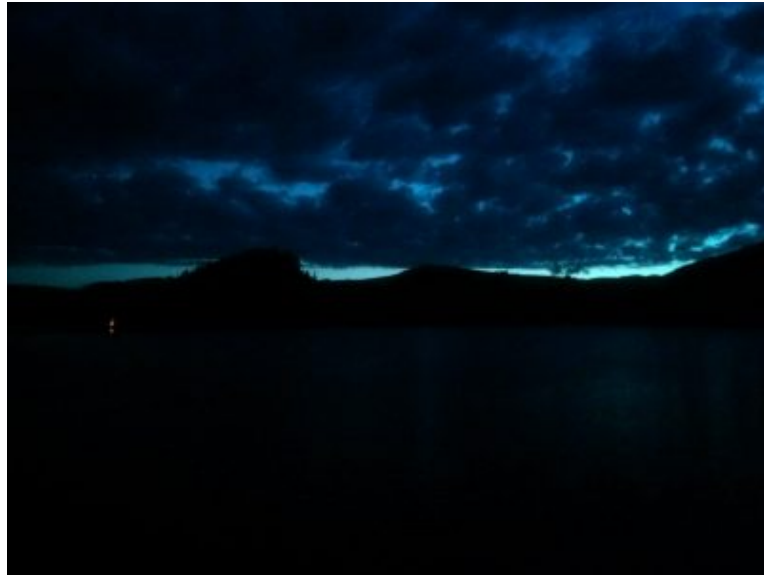
Dawn over Lake Vyrnwy

ride in a straight line and no sign of anything open to find warmth and shelter. Ride round the high street for a few minutes, peering through locked hotel doors before feeling more composed and the decision is made to get on with the next climb.