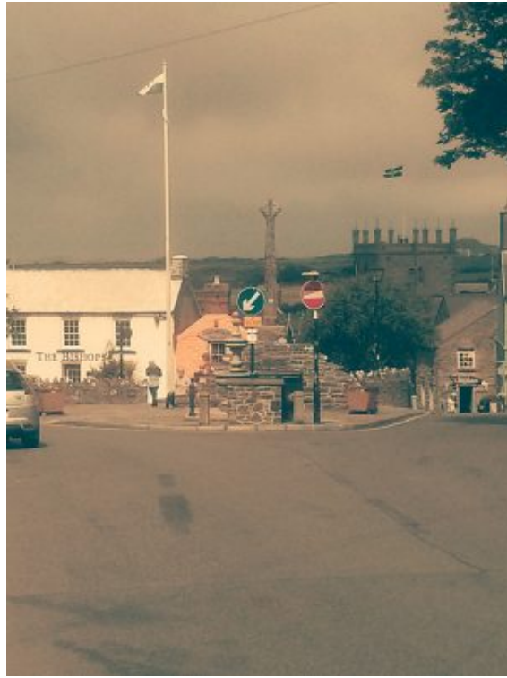
St Davids, Pembrokeshire

A missed turn before Fishguard adds an extra climb and some bonus kms. Steep drop into Fishguard and steep out again sets the theme for most of the rest of the day. Along with scorching sunshine. Feeling a bit sick at St Davids and only manage half a baked potato but push on regardless. Road like a saw edge with sharp pointed climbs and descents in and out of sandy bays. Wonderful views. Interaction with a triathlon and shouting encouragement to the runners. We used to do that once upon a time. Wish I'd eaten more of that potato.