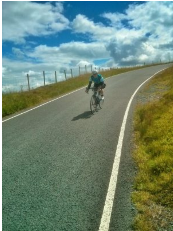
Matt on the mountain

before the final climb of the day back into to El Dub.