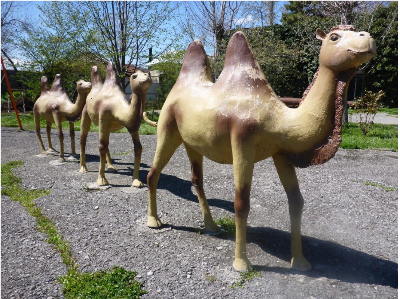
Our first view of a camel train, Sheki