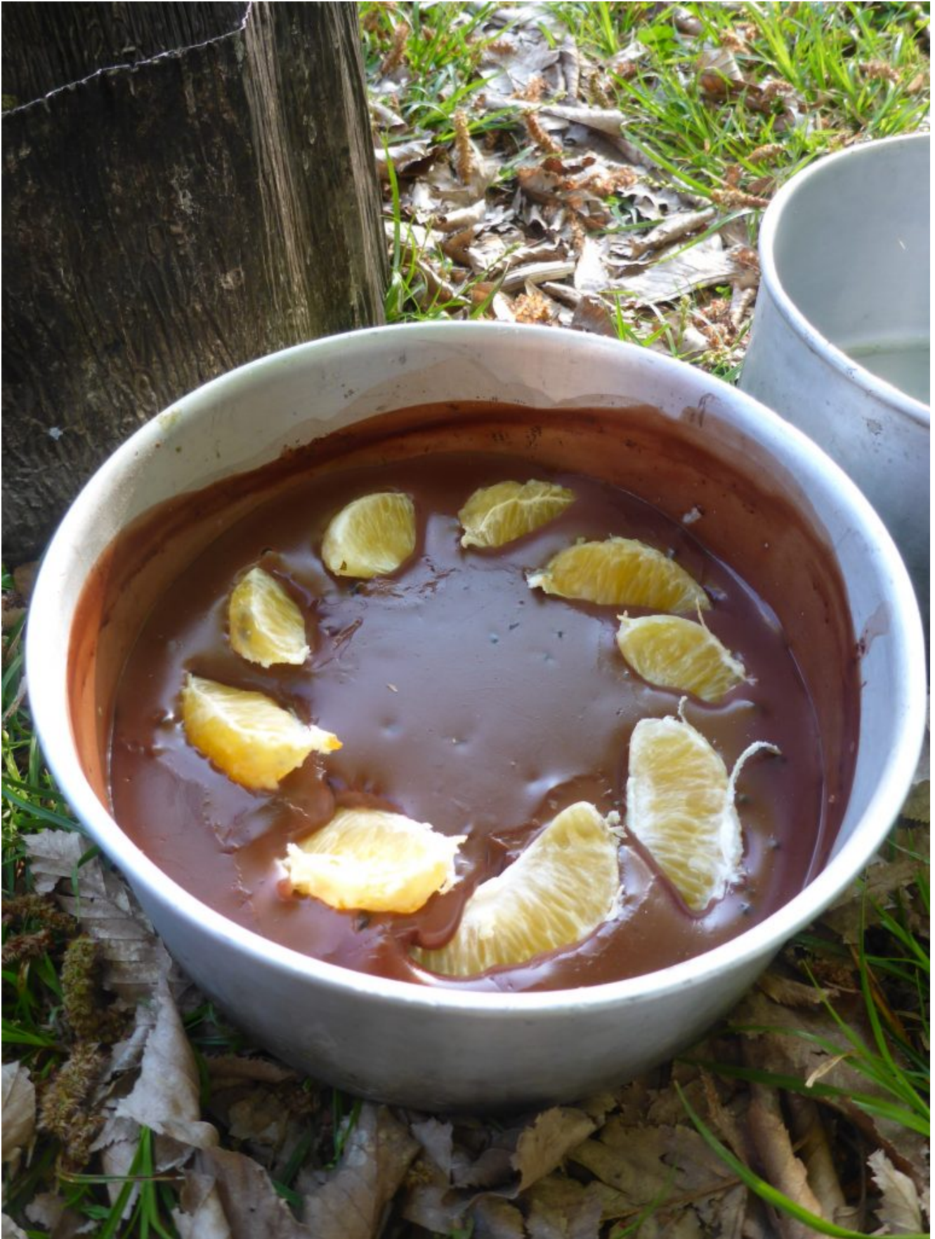
Chocolate pud a l'orange