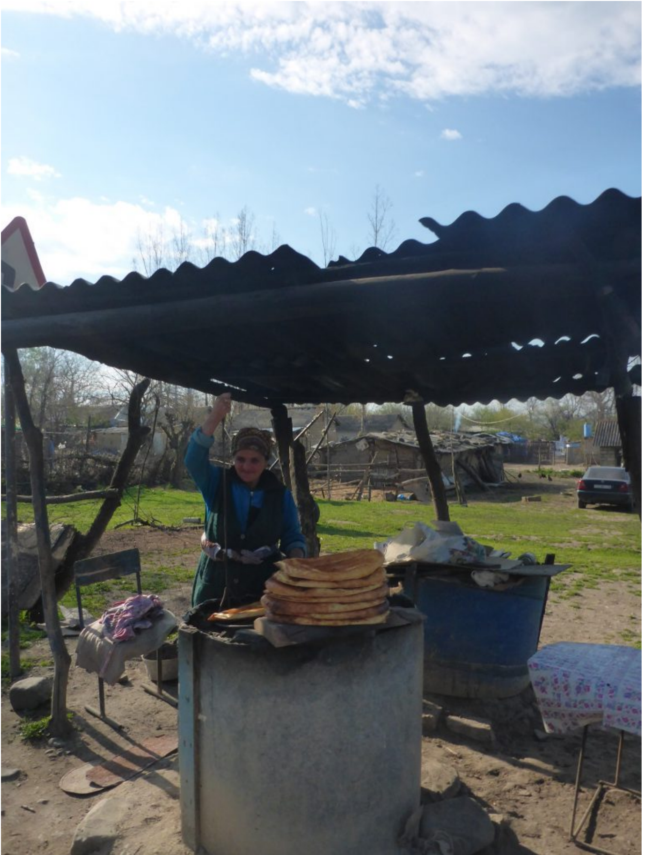
Roadside bread oven