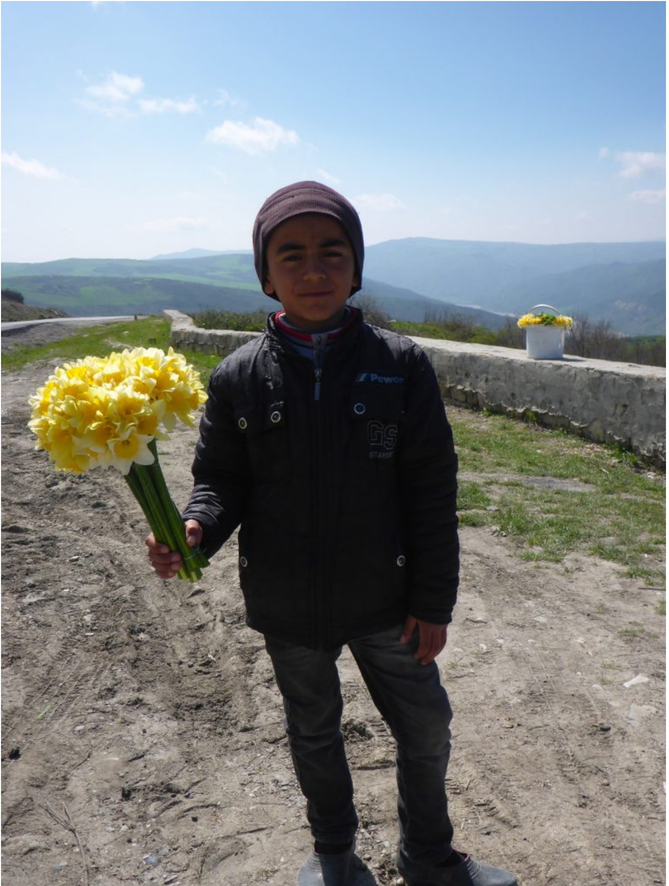
Hill top flower seller

Azerbaijan Fact #5: It is referred to as the land of fire and claims