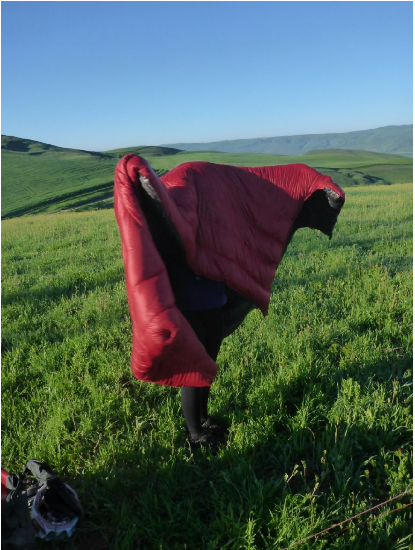
The quilt airing ghost