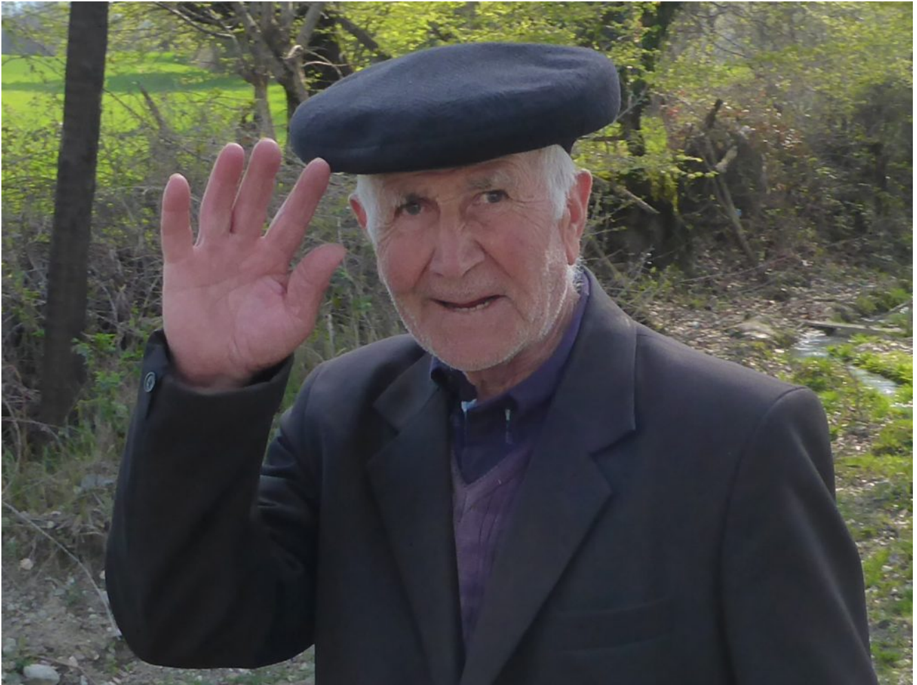
Traditional Azeri head gear

still early in the year plenty of them are closed but even at peak season it's seems surprising that there would be enough trade to sustain them all. One such closed cafe provides an ideal camping spot but without the fire place and stack of wood that we would have enjoyed in Estonia.