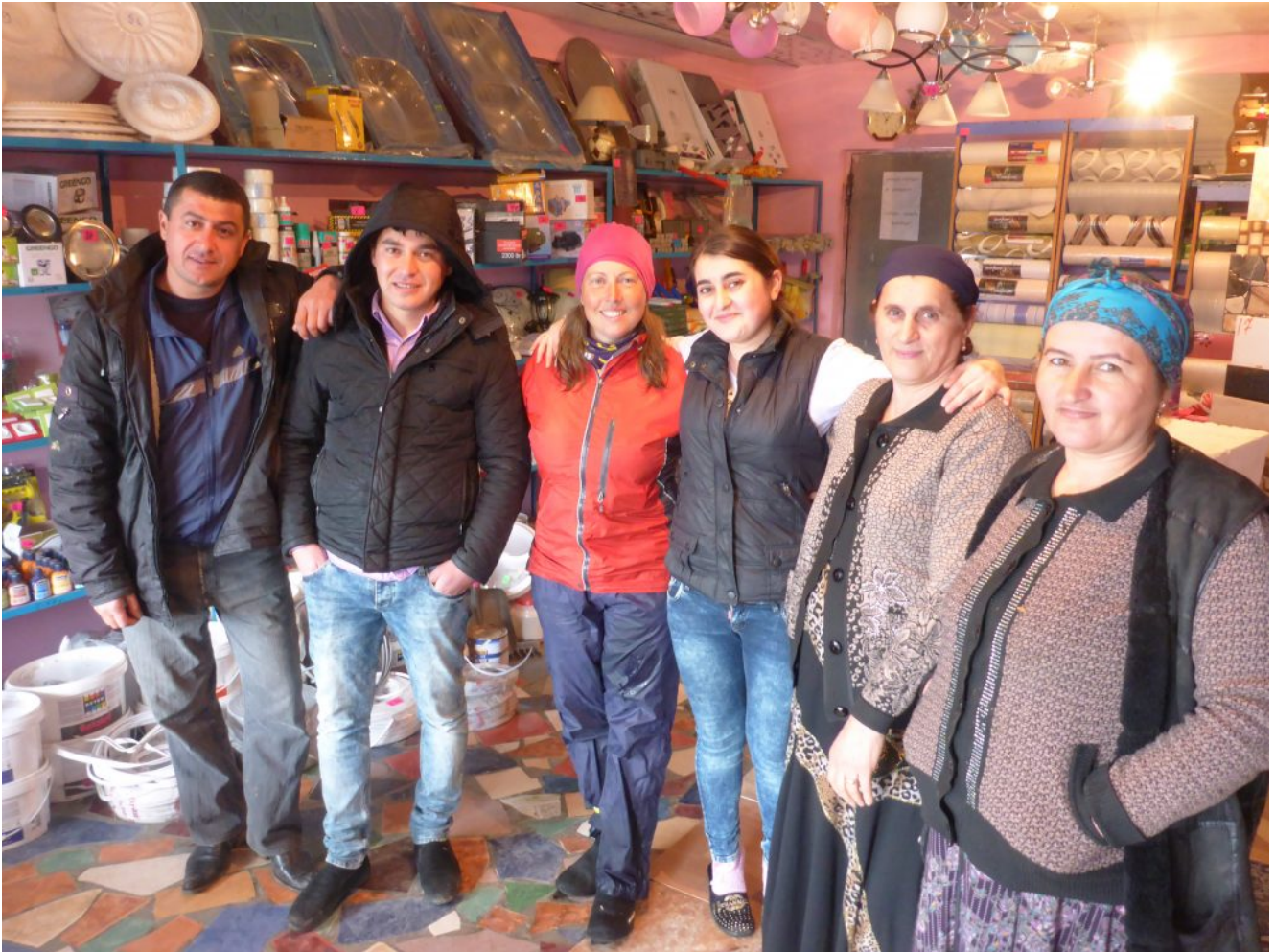
The flooring shop crew

specialist shop there are at least three sales assistants, a manager and two tea ladies. Also typical of elsewhere in the country, the ladies have a magnificent set of gold teeth that shine brightly when they smile but are always swiftly covered up by tightly closed lips as soon as the camera comes out.