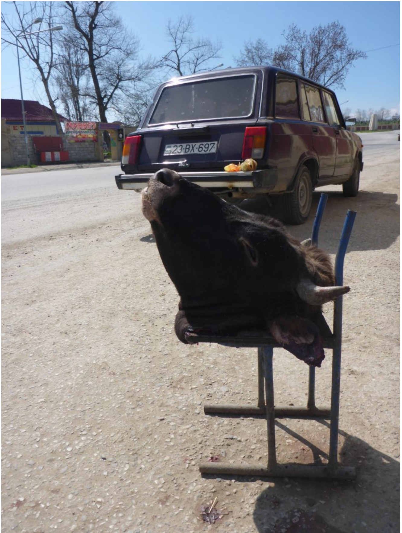
Come and get your fresh cows head