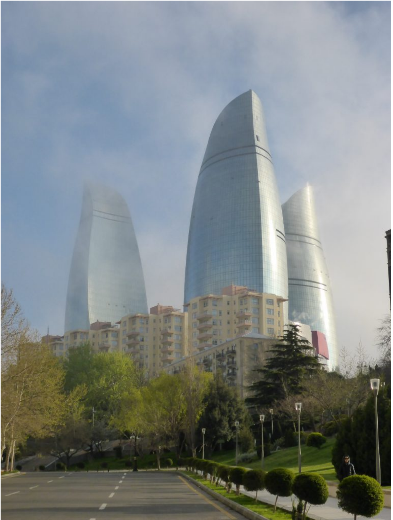
Flame towers, Baku