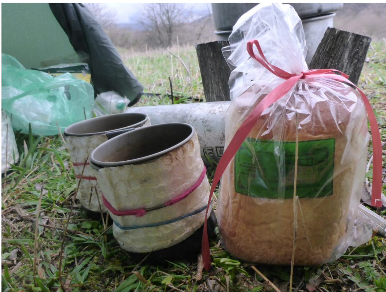
Georgian Easter cake

serving hatch and continue on. It's our second Easter as the Orthodox calendar is different from the Anglican one and this year they are celebrating a week after the UK. We've seen lots of eggs dyed red for sale but not a single one made out of chocolate.