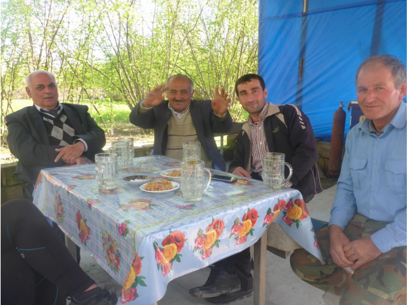
Çay and beer in the orchard

suggested we have to say our thanks and get going otherwise we'd be there all night (not a bad prospect in hindsight).