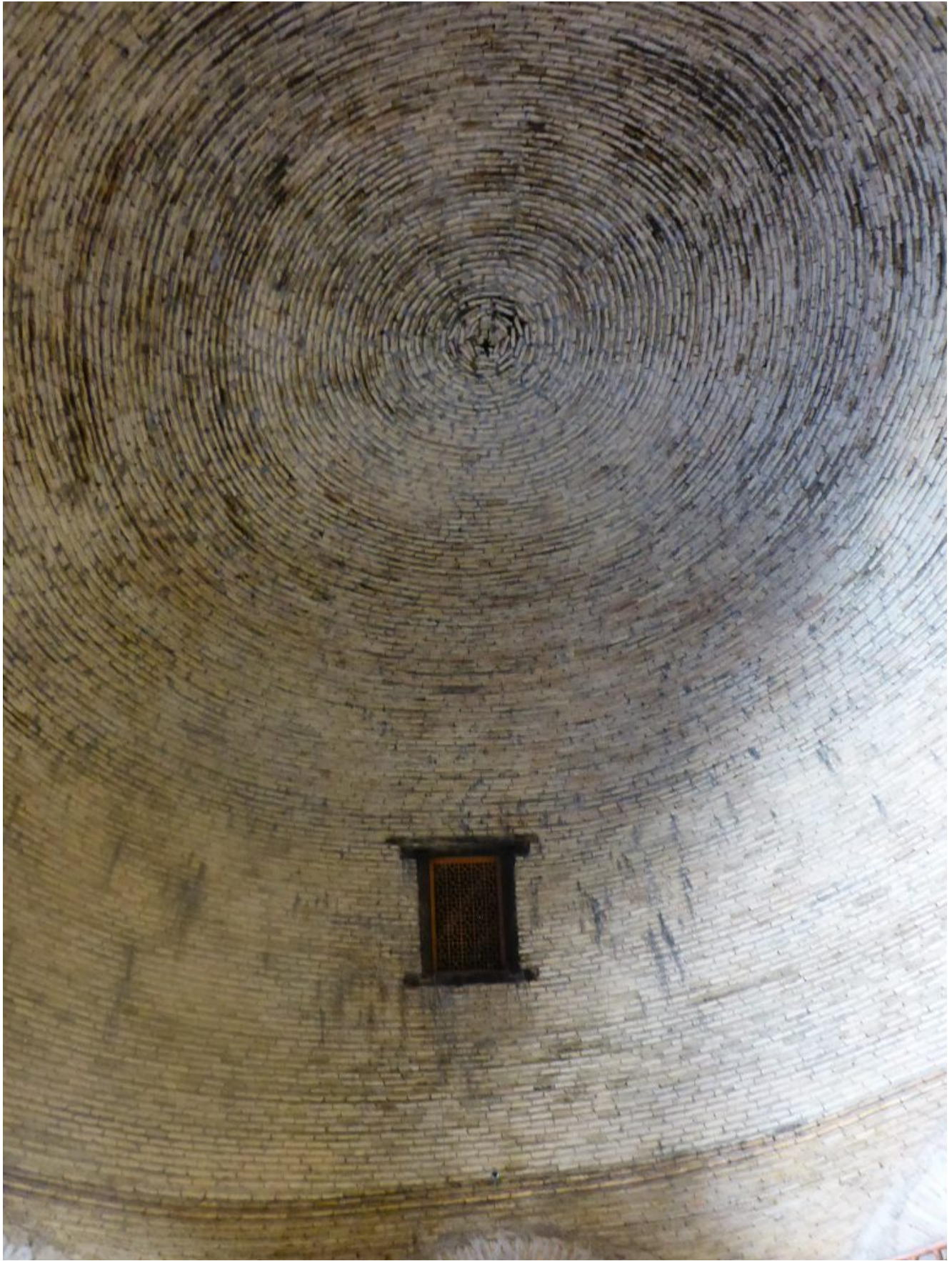
Ceiling in Sheki Caravansary