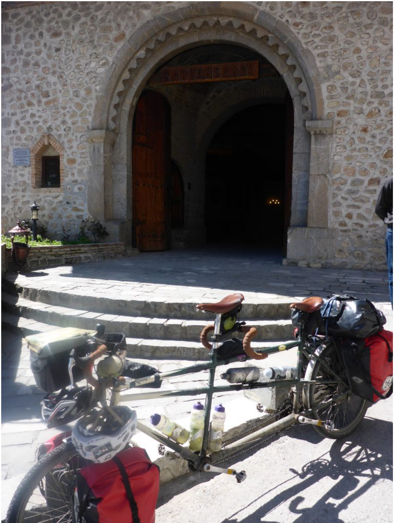
Sheki Caravansary. Requires a climb up a steep cobbled hill but worth a look.