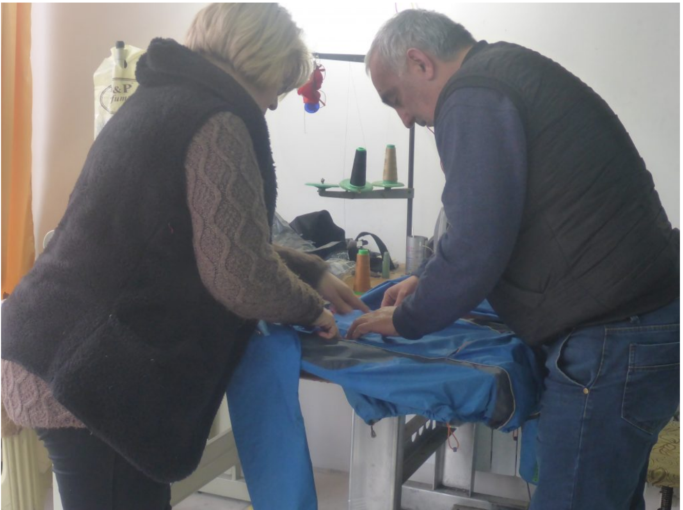
Azeri tailors at work

peer through the holes in the back and the tailors soon get the idea. A roll of faux leather in almost exactly the right shade of blue is brought out and I give them the thumbs up. Their resulting handiwork is better than I could have imagined and I have to admit that the smart new blue diamond deftly attached over the holes is actually an improvement on the original design. It also makes for great advertising space so if anyone wants to add their company logo then let me know and we can negotiate a donation to charity.