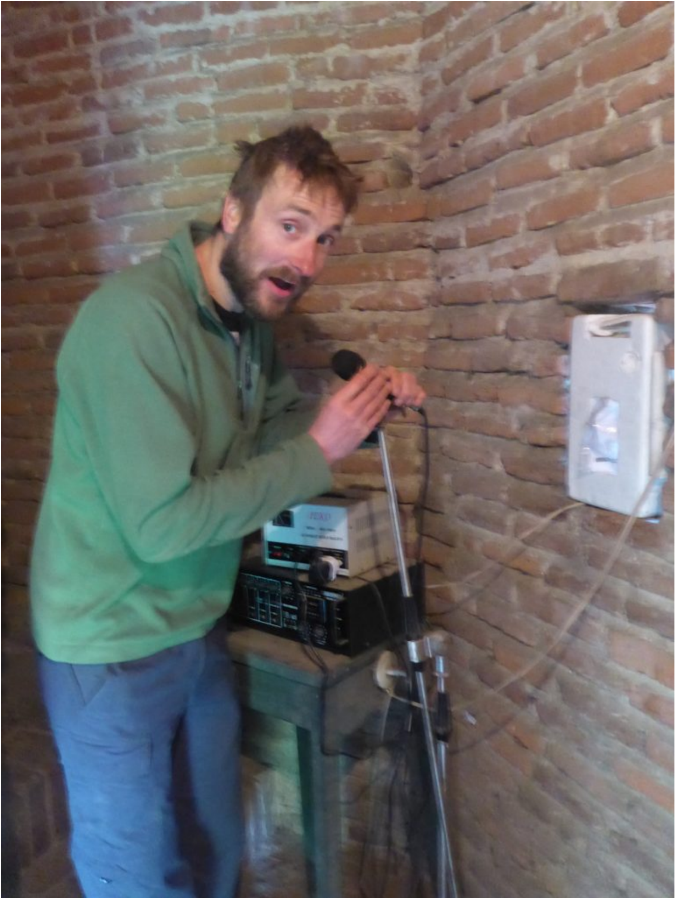
This one goes out to the faithful massive