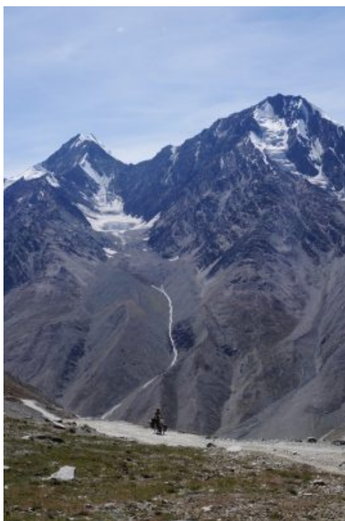
Tara nearing the top of