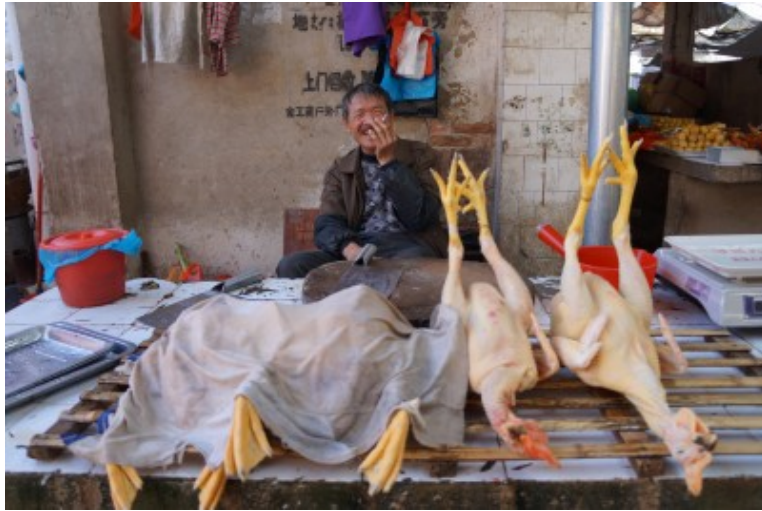
Chicken or duck? China