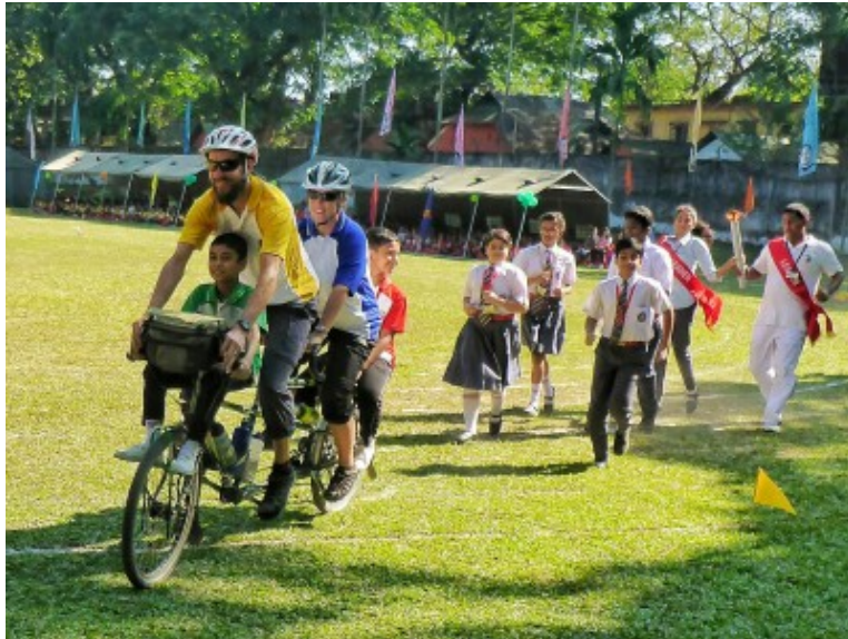
Don Bosco Olympic Opening Ceremony, Silchar, India