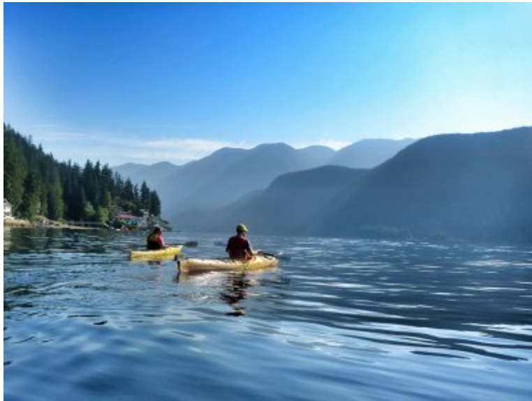
Kayaking near Deep Cove, British Columbia, Canada

I'm a bit behind with the blog so bear with me. There's another episode to finish up our time in Japan to come shortly then I can get stuck in to our trip through Canada and the US which is moving on at pace. You can always keep an eye on the where are we page for a better idea of where we've got to.