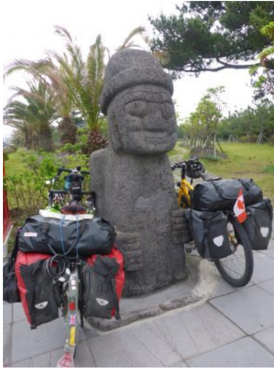
Touring bike guardian, Jeju, South Korea