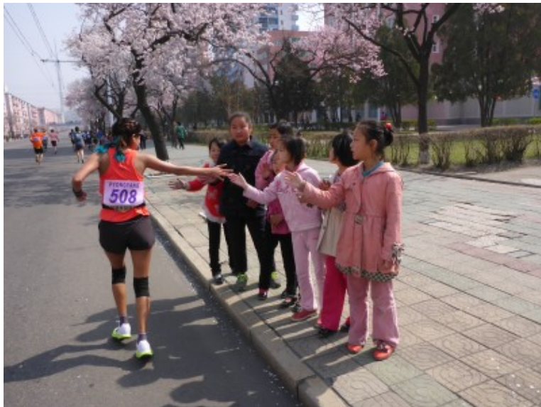
High fives on the Pyongyang Marathon, North Korea