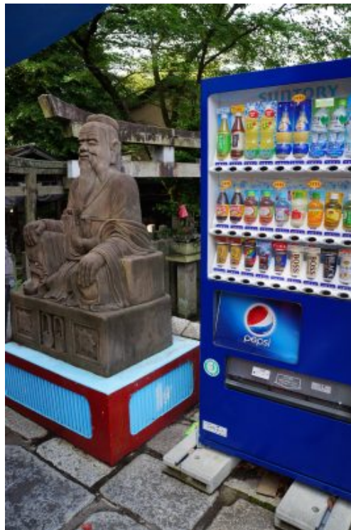
Ancient history and modern convenience in Japan