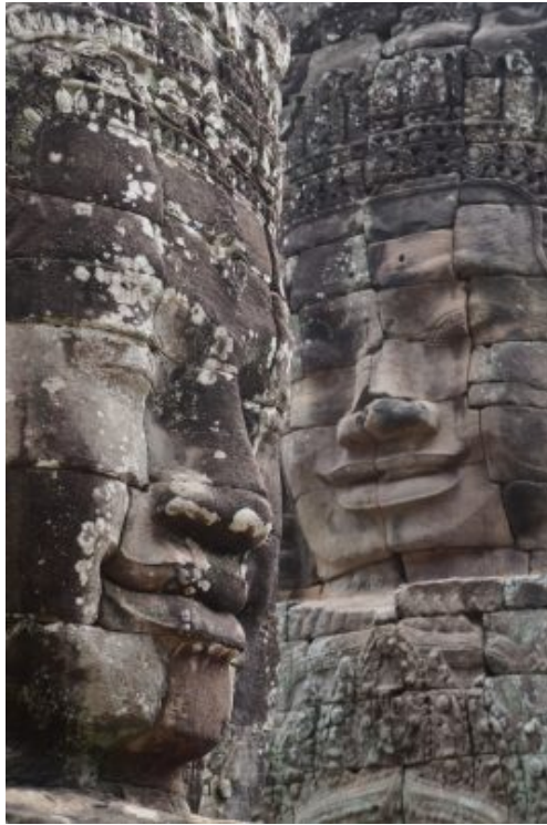
Bayon Temple, Siem Reap, Cambodia