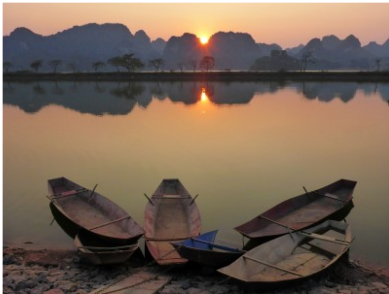
Mỹ Đức, Vietnam