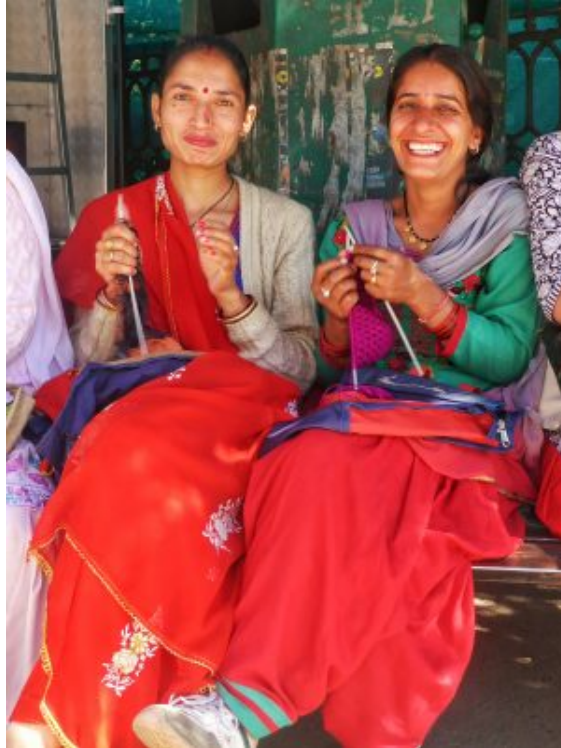
Shimla knitting group, India