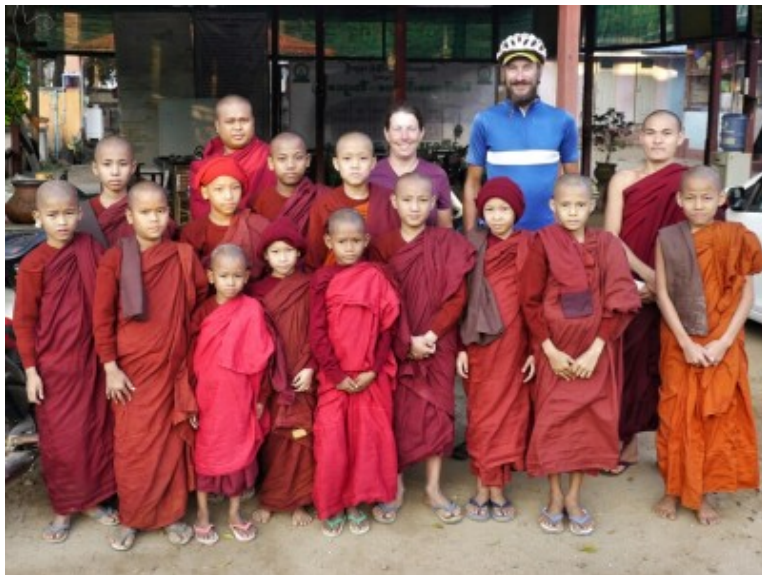
Our hosts in Taungoo, Myanmar