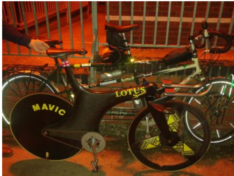
The tandem gets to meet Chris Boardman's Olympic track bike

Other than this, the main challenge has been adjusting back to life in civilised society where sleeping in parks and washing in rivers is generally frowned upon. We opened up the container where all our possessions are being stored and after a quick glance shut the door again. Why do we own all that stuff? Besides, making decisions like which t-shirt to wear have become almost impossibly daunting. Getting used to driving a car again has also been difficult and to begin with I had to open the sunroof and windows so I knew I was actually moving. Getting around by bike is still the preferred method of transport where practical. We're slowly expanding our diet beyond the limitations of two pans and a petrol stove and don't need to try and get the maximum number of calories to the dollar when shopping.