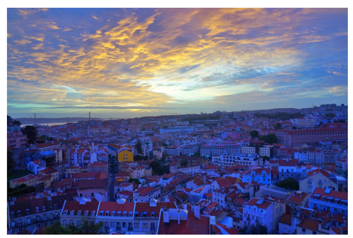
Sunset over Lisbon

a flight. From there we had the shock of not only returning to mainland Europe but also hearing that Trump had won the US election. You know how people remember where they were when they hear about a groundbreaking news story? For us the day of Trumpageddon took place when we were in Lisbon.