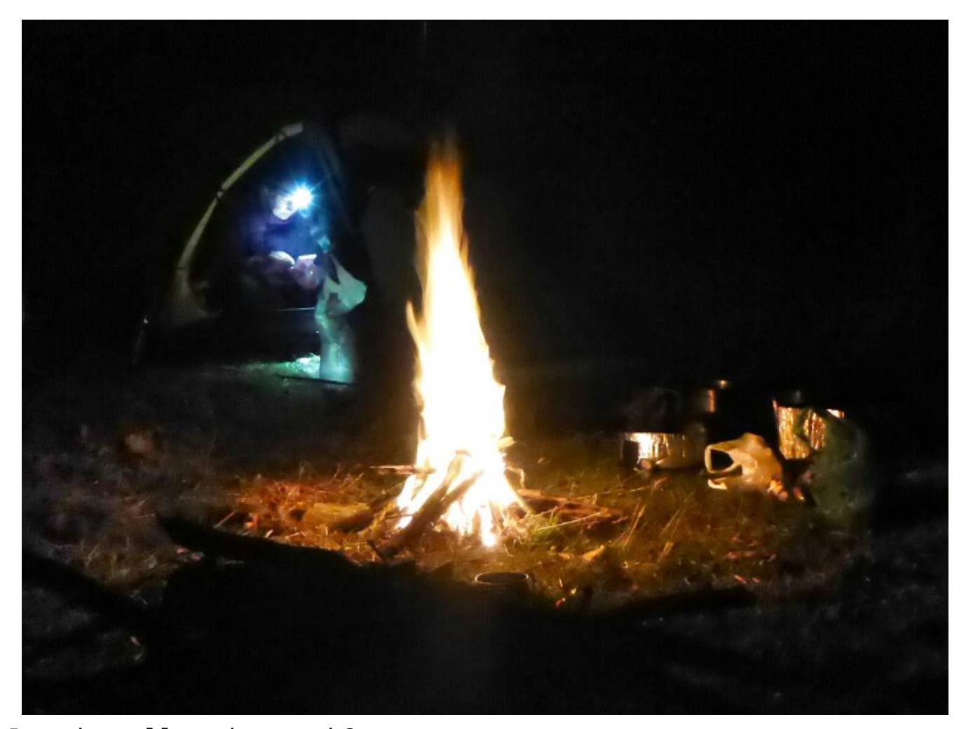
Pas de mallow de marsh?

Getting so close to the finish line it seems like everything is hanging together by a thread. Two tyres exploded in one day. A fork was left behind at a hostel. The stove splutters to stay alight and needs an overhaul. The rear hub on the bike has begun doing some serious complaining. The parts would take too long and cost too much to be sent from the manufacturers in California so we're trying to nurse it through to the end with a can of WD40 and some tlc.