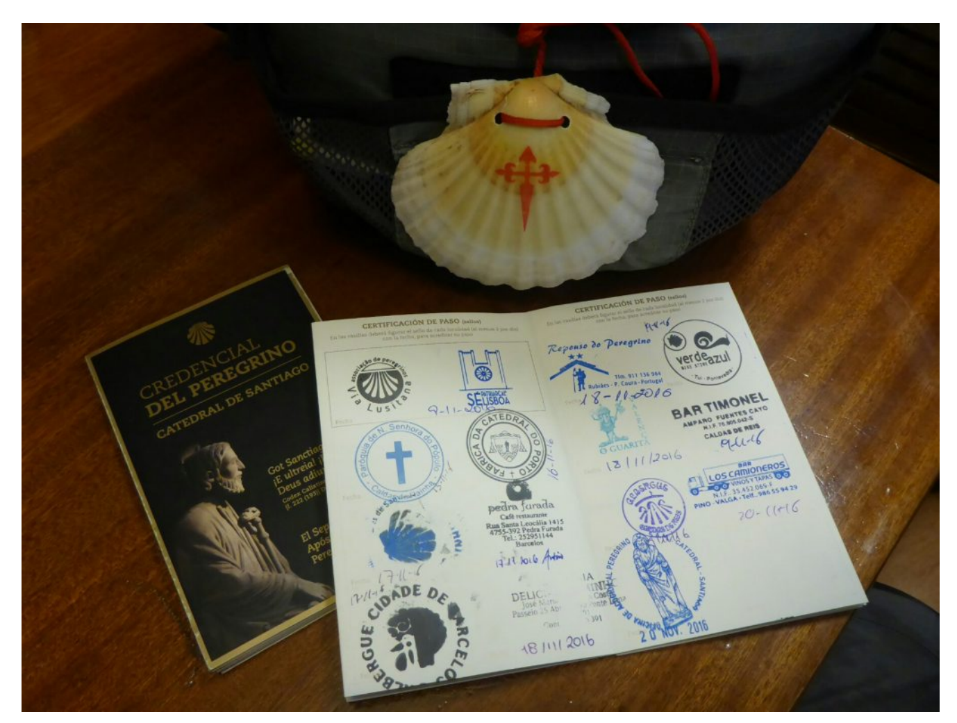
Collecting stamps in our pilgrims' passports