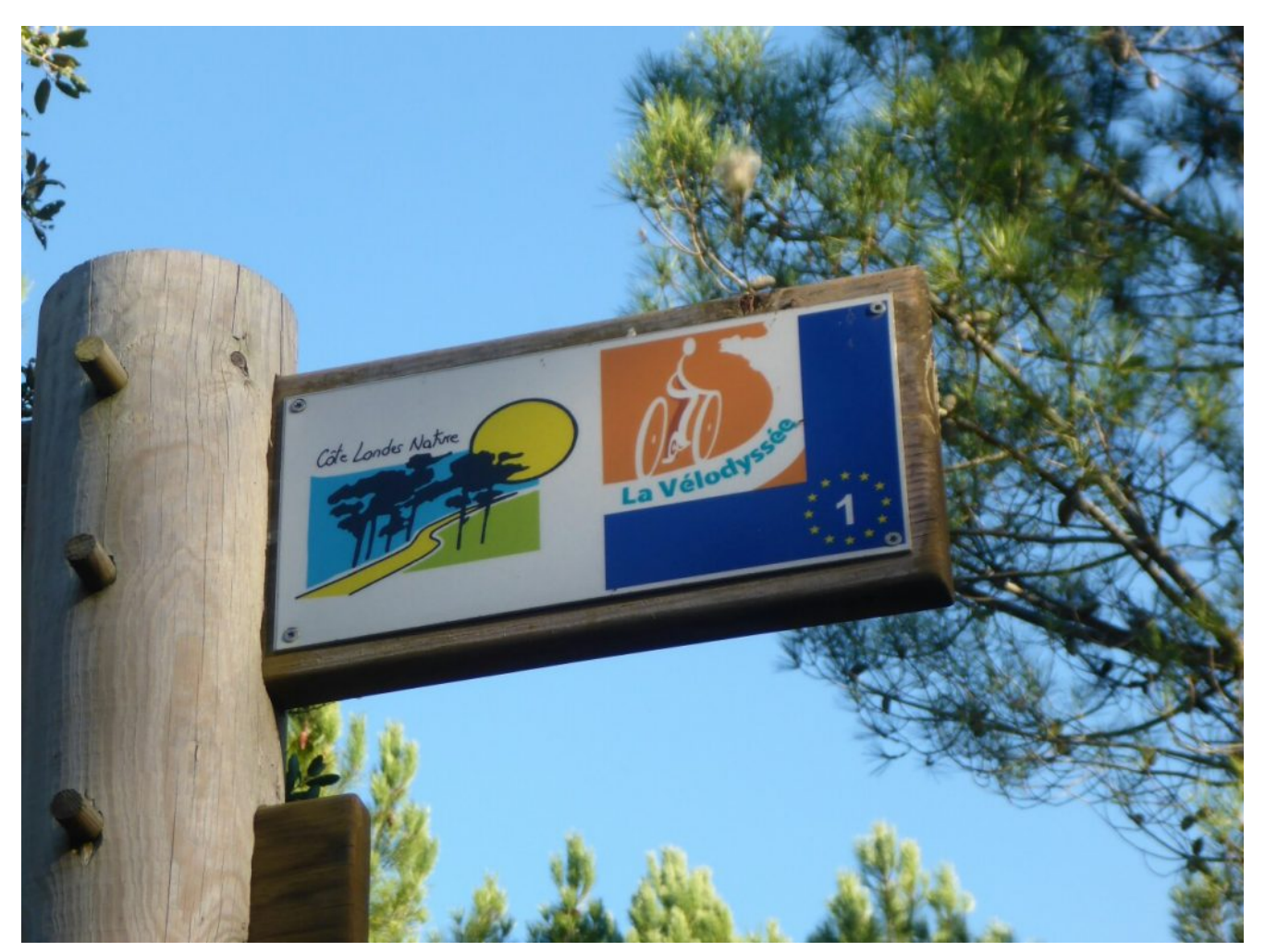
Following the Velodyssey through France

followed up the atlantic coast of France, using the Velodyssey, Euro velo 1 cycle route and then into England for the final stretch.