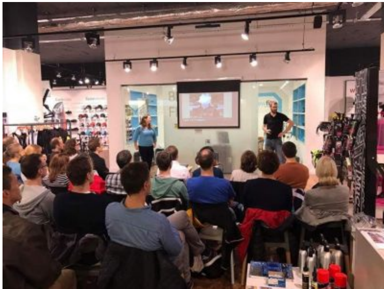
We've given a few talks about our travels since we got back

Soon we had to face the reality of being back in the UK though and the enormous and omnipresent 'What Next' question kept tapping us on the shoulder and asking, well, what happens next? The stock answer for a while was to grin and boldly reply "A second lap". The world is a huge place and there's a whole new hemisphere that we didn't even touch but that's an adventure for another day. So the alternative, in the meantime is to do what everyone else seems to do and that's to try and earn some money so we can afford to stay in this expensive