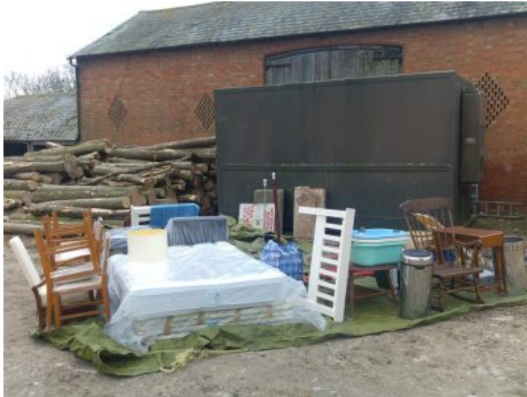
Stuff that has been in storage (and still is)