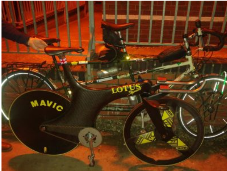
The tandem gets to meet Chris Boardman's Olympic track bike

Other than this, the main challenge has been adjusting back to life in civilised society where sleeping in parks and washing in rivers is generally frowned upon. We opened up the container where all our possessions are being stored and after a quick glance shut the door again. Why do we own all that stuff? Besides, making decisions like which t-shirt to wear have become almost impossibly daunting. Getting used to driving a car again has also been difficult and to begin with I had to open the sunroof and windows so I knew I was actually moving. Getting around by bike is still the preferred method of transport where practical. We're slowly expanding our diet beyond the limitations of two pans and a petrol stove and don't need to try and get the maximum number of calories to the dollar when shopping.