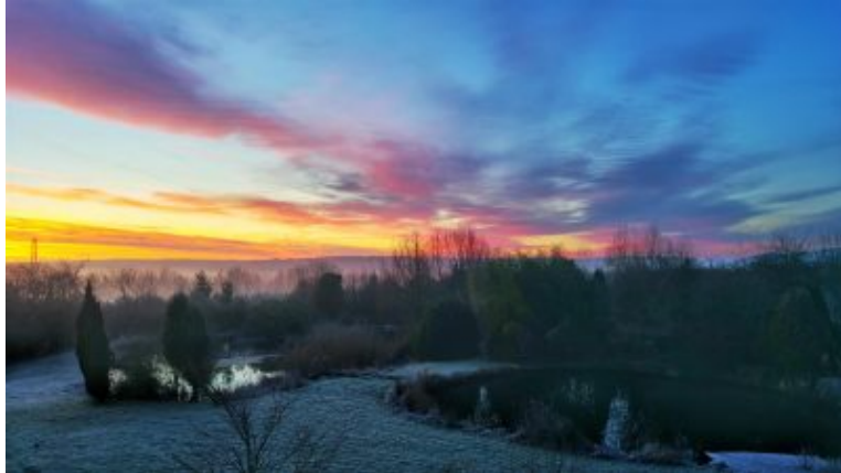
A winter morning in Worcestershire

skills in an enterprising way but to be honest we were so caught up with the whole process of actually cycling that a Grand Plan never really took shape. But in the cold light of a UK winter we began to piece together some of the things that we'd learnt throughout our journey and to mould them into some sort of business proposition.