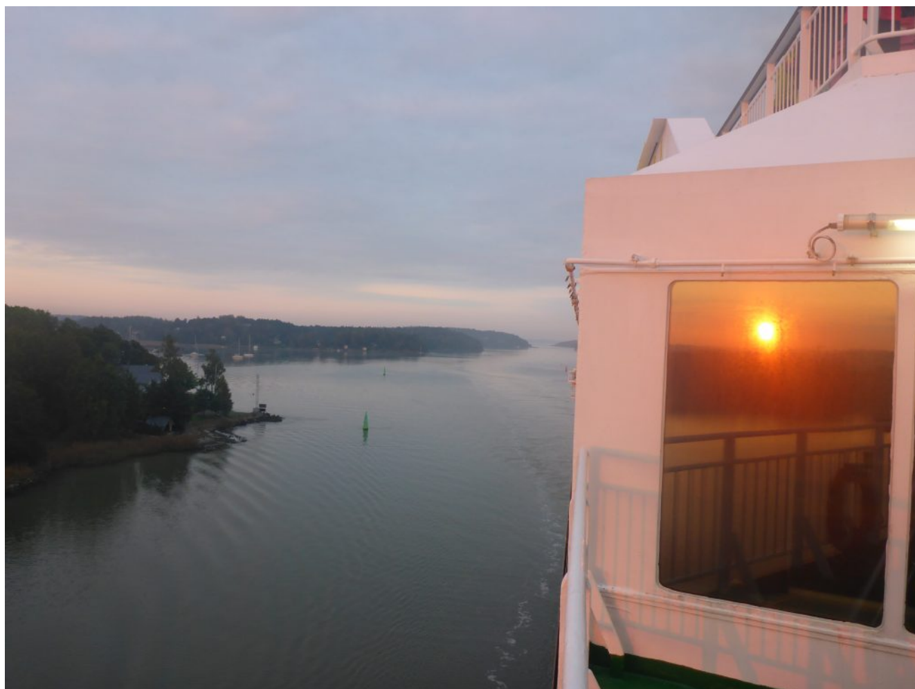
Sailing into Turku at dawn

to ride round the city centre. Finland is the most expensive country yet and we get charged 4 euros for a coffee. Our food bills are comfortably 15-20% more than even Denmark and Sweden too but maybe we're just eating more. Turku is 60 degrees north, roughly in line with Lerwick on the Shetland Islands, and marks the most northerly point of our whole trip, from here we can begin following the flocks of geese we've been seeing and start heading south.