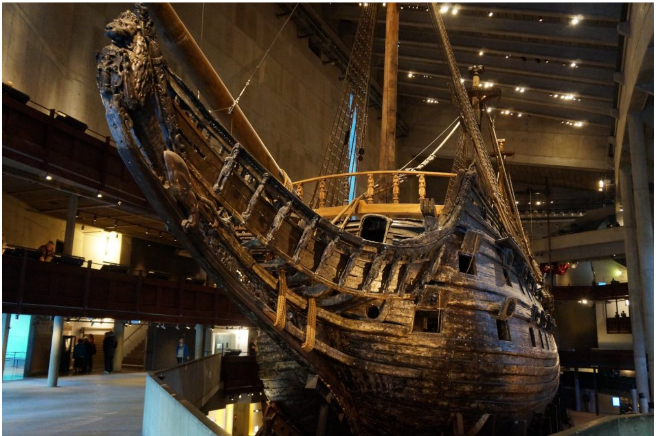
The Varso museum

We arrive in Turku as dawn breaks and have a couple of hours