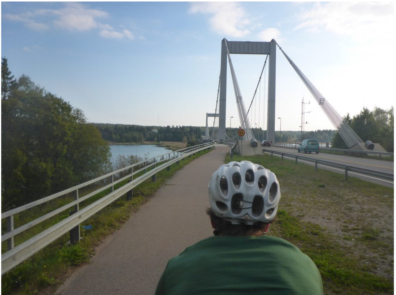
First bridge onto the Archipelago

ferry that has to weave between hundreds of islands before eventually arriving at Utö, a rock out in the middle of the sea with just a handful of permanent residents and Finland's first lighthouse. We decided to go for it and ride some of the way that same day, camp, then ride into Pärnäs to catch the 2:00pm ferry to Utö the next day. Along the way we pick up a copy of the local paper and see we've made the front page! At Pärnäs a couple say they'd read about us that morning too but thought we were going to a different island? The reporter had written that we were off to one of the other islands in the archipelago which left us with images of bunting being hung out and a crowd gathering somewhere else only to find we never arrived.