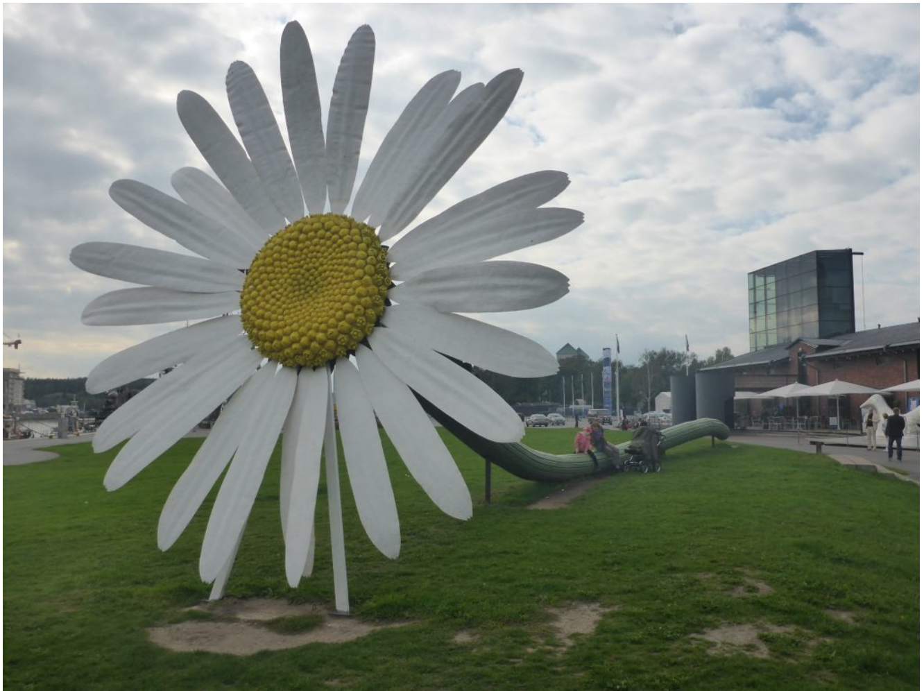
Daisy, Daisy in Turku

Turku sits on the South West corner of Finland where the coast is littered with some 40,000 islands forming a huge archipelago. We had been toying with the idea of venturing out onto some of the islands as there are a few marked cycle routes that form loops of varying lengths centred around Turku. In fact, for anyone looking for inspiration for a cycle tour of a week or more then this would be a very good place to come. Unfortunately some of the key ferry crossings we'd need to take stop operating at the end of August so we're left with the choice of the biggest loop, that would take a week or a short out and back route. We explain our dilemma to Taina and she immediately sways us towards the out and back route by suggesting we try and get to the most remote and southernmost inhabited island of them all: Utö. This would involve 65km of hopping across several islands, most with bridges between them but also a slightly longer crossing on a ferry before we get to the little port of Pärnäs. From Pärnäs it's a 4.5 hour